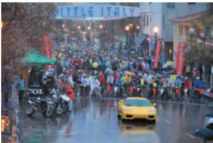
The Gran Fondo San Diego starting line in Little Italy last April. The Italian bike ride was brought to San Diego from Italy.

Clustering together as every new immigrant population does, they formed small pockets of their Italian homelands in cities such as San Francisco, St. Louis, Philadelphia, Boston and New York. Little Italy was born. But whether these once bustling cultural hothouses can survive and indeed thrive as more than just a collection of restaurants and shops is a matter of debate. Some, like LiMandri, argue that it's a travesty to let Little Italys die; others contend that their changing nature is inevitable.