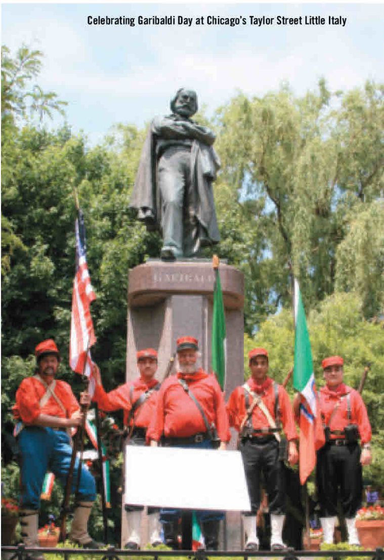
Celebrating Garibaldi Day at Chicago's Taylor Street Little Italy

"There should be organizations out there whose missions are to push the image of Italy