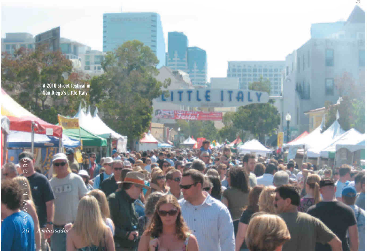
A 2010 street festival in San Diego's Little Italy